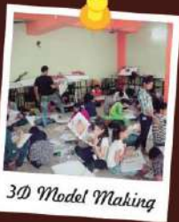
3D Model Making