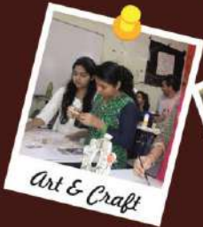
Art & Craft