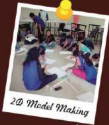
2D Model Making